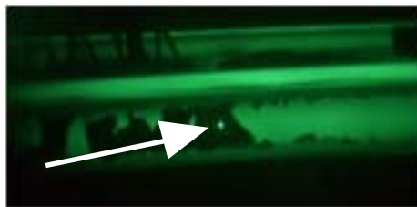
Laser beams on the scale

Speed measurements made by this system (see graph below) clearly show mould oscillation effects on the caster speed down by the torch cutter. Previous measurements presented on slab casters only showed a scattering of measurements throughout the speed range, and were unable to follow the actual speed of the caster. Also shown is the average caster speed. The speed is also integrated to obtain length. The length can be used to control the torch cutter to obtain accurate slab lengths.